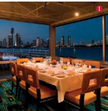
PHOTO CREDITS: 1. Peohe's in Coronado 2. The Keating Hotel Group 3. San Diego Museum of Art

Please also take a look at some of our featured partners who can create amazing events including: elegant art gallery affairs, hip bowling parties, an evening at sea, urban chic soirées and tropical-themed events that will take you away.