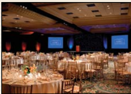
Manchester Grand Hyatt

The times are still uncertain but one thing is for sure – employees are working harder than ever! As the cooler air and shorter days kick in, it's time to think about planning the company's holiday celebration. There are many reasons to keep this tradition alive including boosting camaraderie, thanking employees for their service or maybe just celebrating that you've made it through the year!