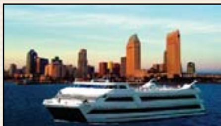
Hornblower Cruises and Events

With longer days and warmer nights just around the corner, now is the perfect time to start planning your upcoming events. Invigorate an ordinary retreat, meeting or company function by getting out of the office. Consider planning the following events that are ideal for the spring and summer months.