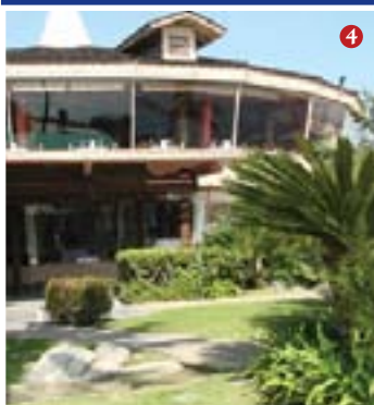
PHOTO CREDITS: 1. NTC Promenade 2. Gringo's Cantina 3. Plush Impressions 4. Bali Hai Restaurant 5. San Diego Harbor Excursion 6. The Dana on Mission Bay

For more ideas, please call us at (858) 695-3895 or visit our website at www.Event-Connect.com to view hundreds of our venue and vendor partners or to request a complimentary, customized recommendation list for your event.