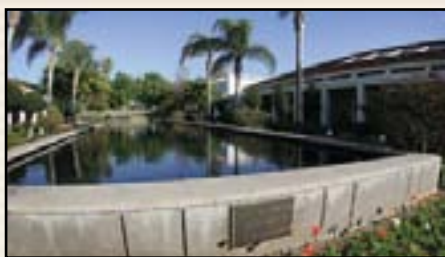
The Richard Nixon Library & Museum

With longer days and warmer nights just around the corner, now is the perfect time to start planning your upcoming events. Invigorate an ordinary retreat, meeting or company function by getting out of the office. Consider planning the following events that are ideal for the spring and summer months.