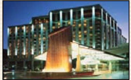
Pechanga Resort & Casino

Many of these larger locations also have several rooms in a variety of dimensions that can accommodate intimate to large groups. Utilize the flexible space options by hosting your training session in one part of the venue followed by break-out sessions or a reception in a distinct space. This will add variety and movement to your event.